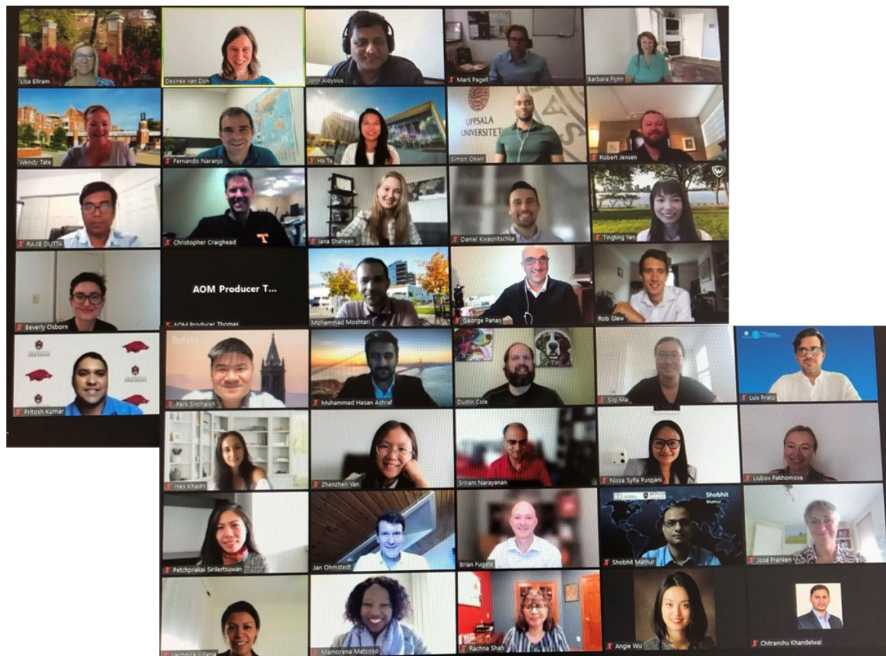
Consortium group picture: